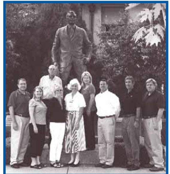
Members of the FRED Board of Directors during a break from their meeting in Colorado Springs, Colo.