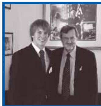
2009 Leadership Through Learning program students visit the OPASTCO office (above and upper right) and meet with their congressional representatives (right) while in D.C.